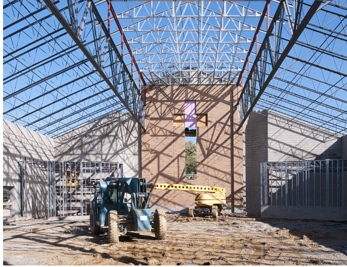
Holy Cross Lutheran Church New Sanctuary More room for "old and new faces"

A Night in Bethlehem December 10 and December 11