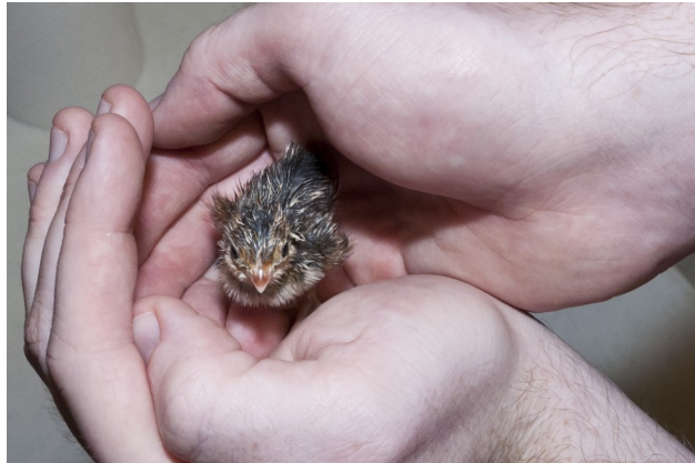
Quincy the quail resides in the Kindergarten class.

Upcoming Events: Easter Breakfast April 27 8:00–10:45 AM Vacation Bible School June 20–24