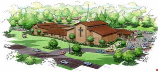
Proposed Address for Holy Cross Lutheran Church

Holy Cross Lutheran 7707 North Market Avenue North Canton, OH 44721